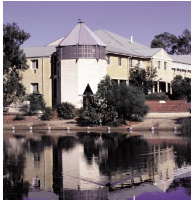
Edith Cowan University, Australia