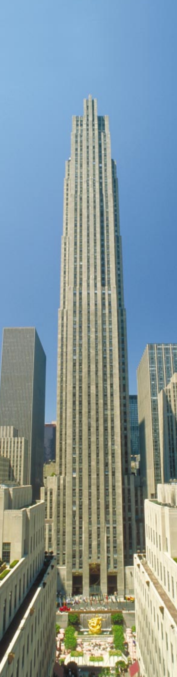
Rockefeller Center, USA