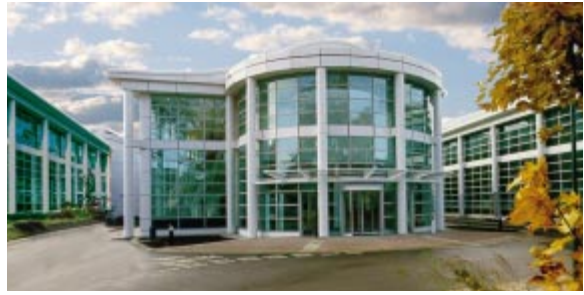
National Physical Laboratory, United Kingdom

Please contact us if you like further details and information about any of our past projects. Our customer base encompasses all industries and every type of building from private homes to large facilities owned by multinational companies.