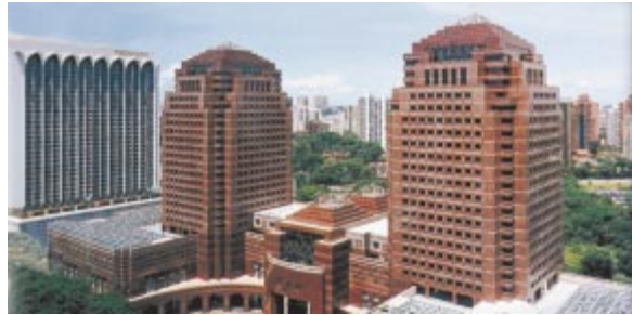
Ngee Ann City, Singapore

We are one of the few, perhaps the only, building controls company to have systems installed on all seven continents.