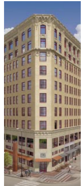
Seaboard Building, USA

TAC Head Office Malmö, Sweden (46) 40 38 68 50