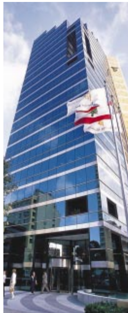
Byblos Bank, Lebanon