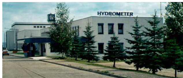
Production facility Apolda

The state-approved testing centre for water measuring equipment (WT-09) is also accommodated on the works site in Apolda.